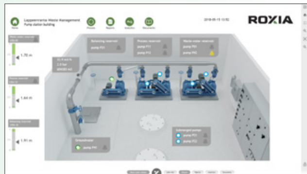
EKJH pump station and remote view in Roxia Malibu.